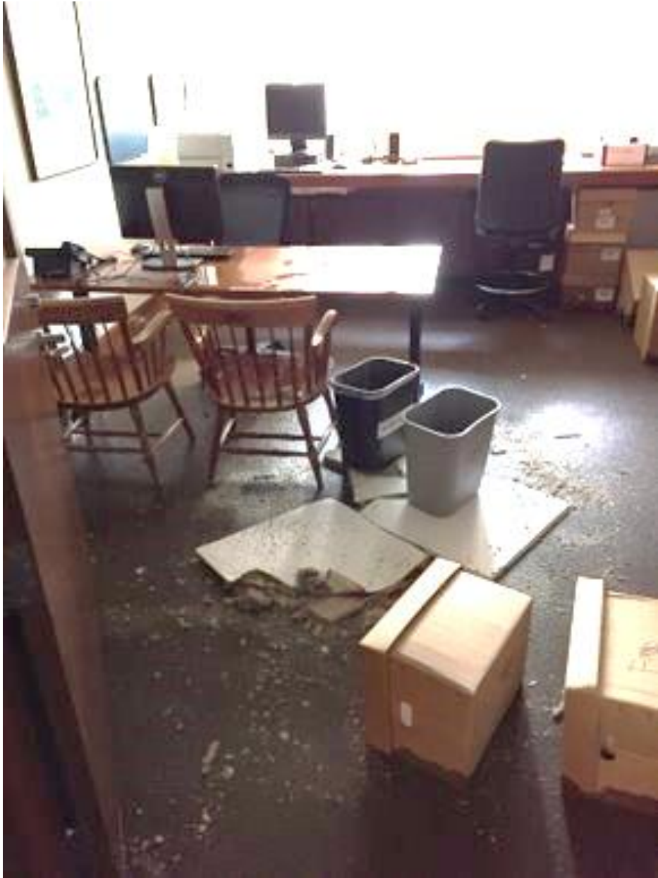
First Floor Circulation Desk Area